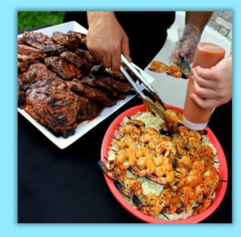
(Price based on Market Price)

BBQ Pulled Pork our own grilled & braised pork, smothered in delicious, mesquite BBQ sauce